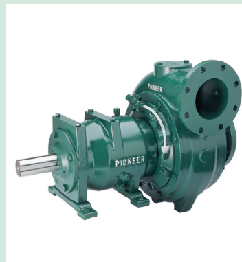
Typical Pump Configuration