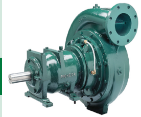
Typical Pump Configuration