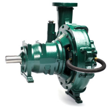
Typical Pump Configuration