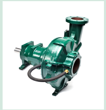
Typical Pump Configuration