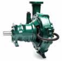
Typical Pump Configuration