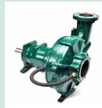
Typical Pump Configuration